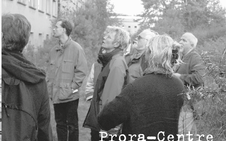
Prora-Centre Education Documentation Research