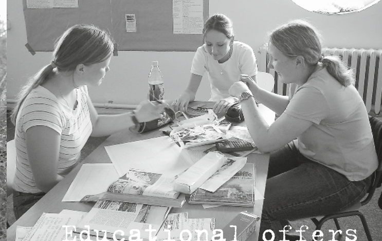
Educational offers Prora-Centre

The “Strength Through Joy-Seaside Resort Rügen“ near Binz, which was planned by the NS organisation “Kraft durch Freude“ (KdF) for 20,000 holidaymakers, never went into operation. But it was considered as an example of the achievements of Nazi social policy in contemporary propaganda. The foundation stone was laid in 1936, but at the outbreak of the war in 1939, the construction work was stopped and Prora was used for “war-related purposes“: for the training of military units, as makeshift accommodation for the bombed-out and evacuees and as a hospital. For this purpose, forced labourers had to temporarily expand Prora. Already in August 1949, the development of a new covert army began in Prora. The Kasernierte Volkspolizei (KVP) expanded the facility as barracks from 1952. From 1956, Prora was the military base of the National People’s Army (NVA). Several thousand construction soldiers, the GDR’s conscientious objectors, mostly employed in the Mukran ferry port, had to do their service in Prora. After the reunification, the Bundeswehr took over the facility. In 1992, Prora became the property of the federal government, which sold the site block by block over the years.